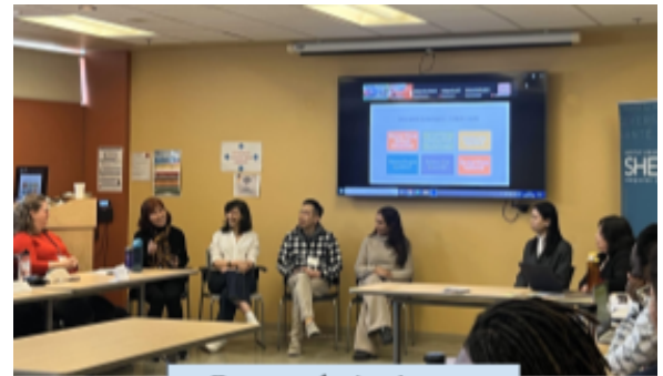
Research Assistant Presentations