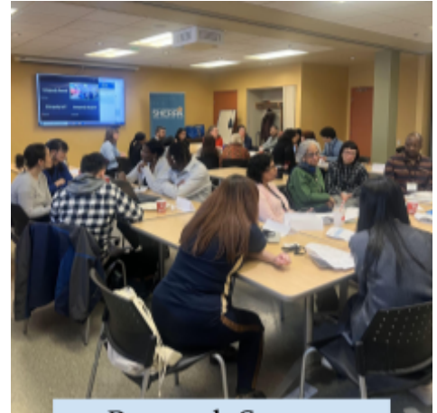
Research Stream Planning

Over the course of the summit, attendees participated in a variety of sessions that highlighted key findings from Phase 1, explored collaborative opportunities for data analysis and publication, and discussed the upcoming intervention phase of the project. The event also included dedicated time to hear from research assistants and students, whose on-the-ground experiences offered valuable perspectives, as well as presentations from local community partners who are deeply engaged in the work in Montreal.